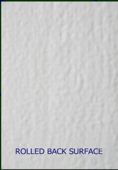
ROLLED BACK SURFACE