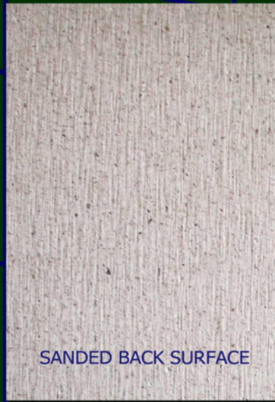
SANDED BACK SURFACE